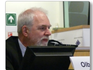
▲ Dr Jan Olbrycht Member European Parliament