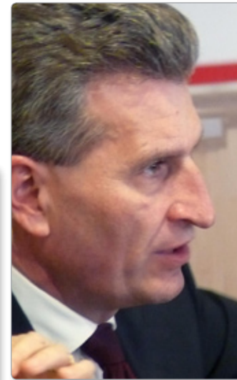
◀ Günther Oettinger Commissioner Responsible for Energy European Commission