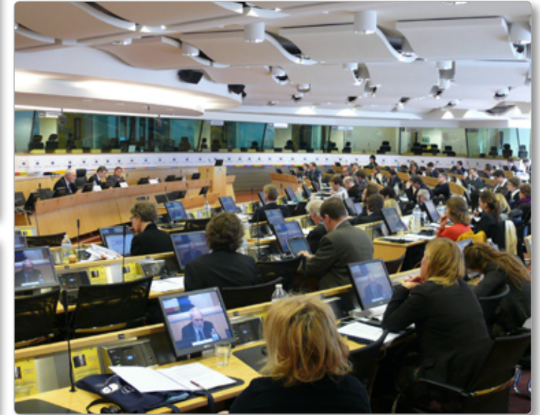
▼ The conference room in full flow