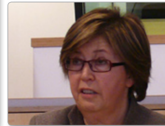
▲ Ms Mercedes Bresso President Committee of the Regions